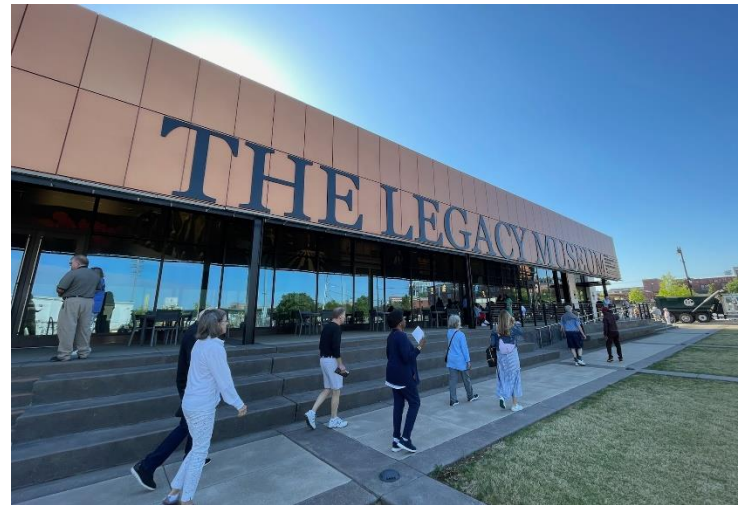
The group enters the profoundly moving Legacy Museum, Montgomery, AL