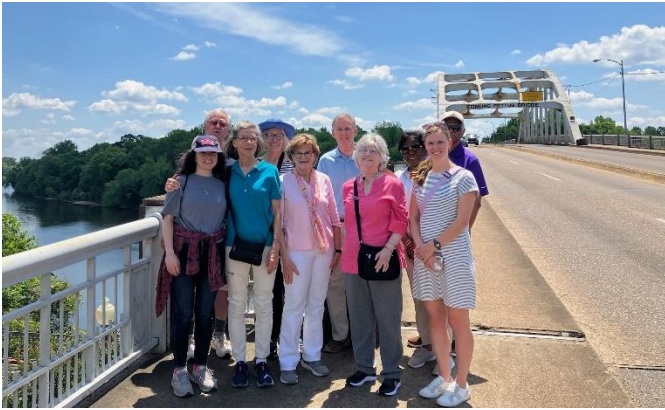
RTF Group gathers at the Edmund Pettus Bridge, Selma, AL